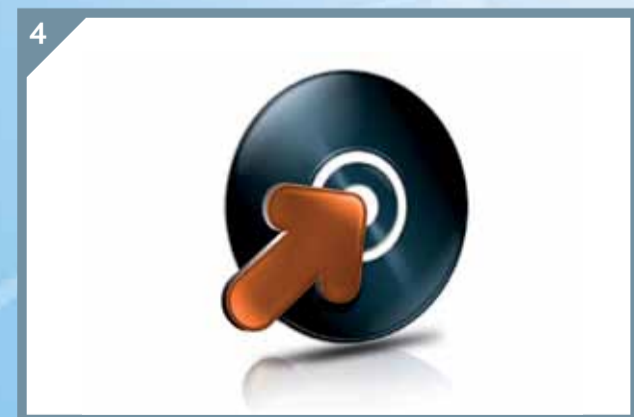
4 Save and backup your notes and diagrams.