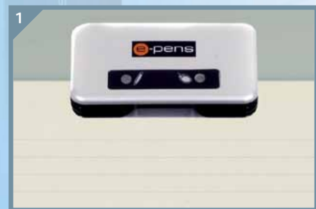
1 Attach the e-pens base unit to normal paper.