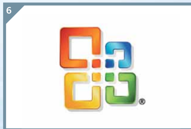
6 Export converted text and diagrams to MS Office and other applications.