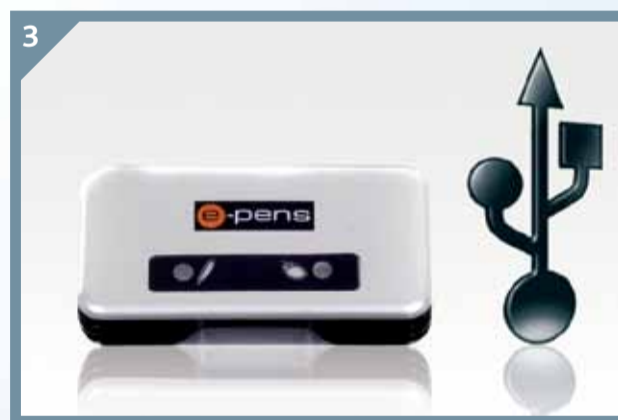
3 Connect the e-pens base unit via USB to your PC.