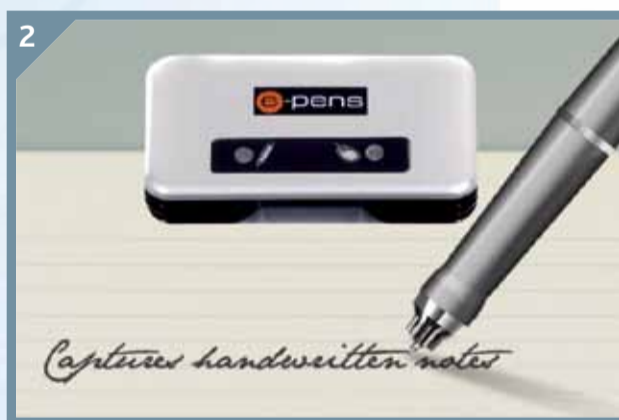
2 Write your notes as normal with the ink filled e-pens digital pen.