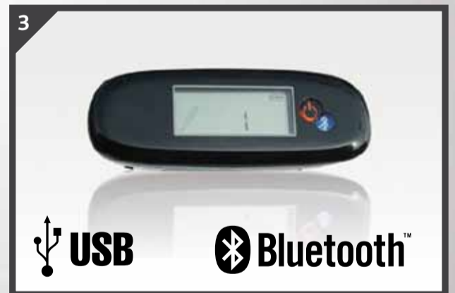
3 Upload your notes via USB to PC and/or via Bluetooth to PC, Android & Blackberry