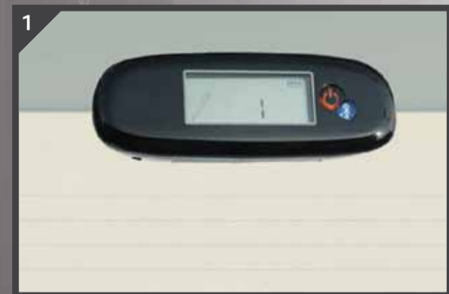
1 Attach the e-pens base unit to normal paper.