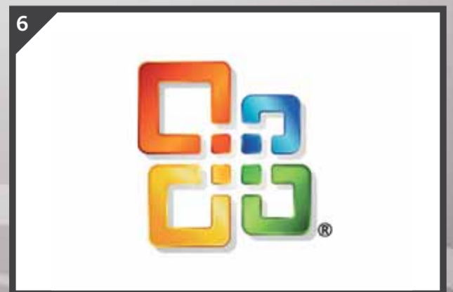
6 Export converted text and diagrams to MS Office and other applications.