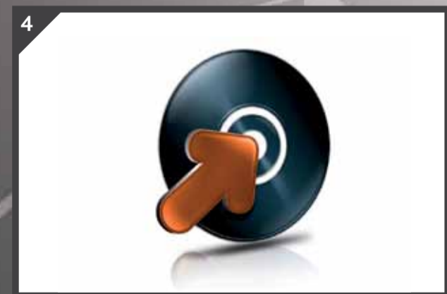
4 Save and backup your notes and diagrams.