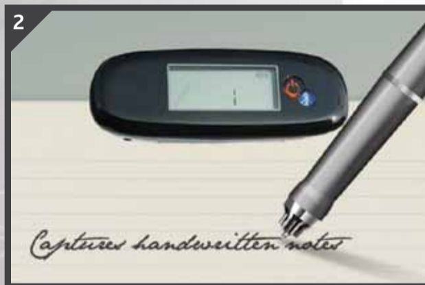
2 Write your notes as normal with the ink filled e-pens digital pen.