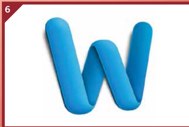
6 Export converted text & diagrams to word processing, email or other applications.