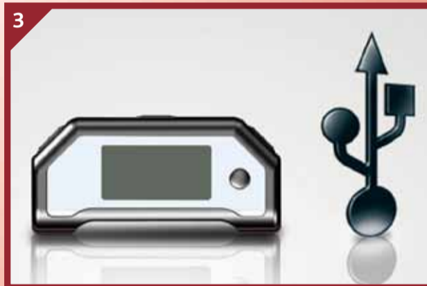
3 Upload your notes via USB to the note manager software.