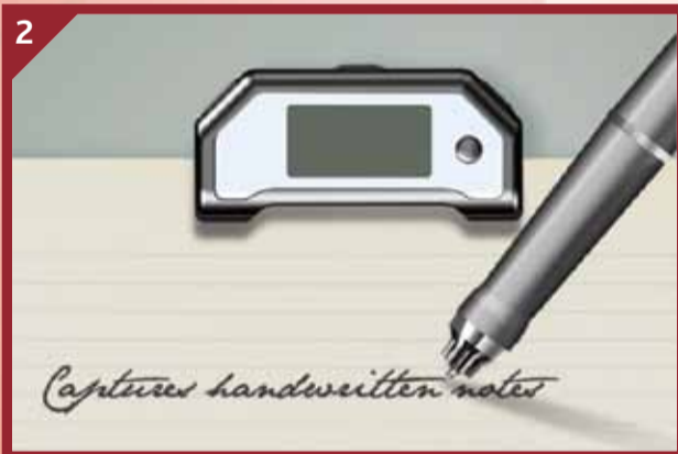
2 Write your notes as normal with the ink filled e-pens digital pen.