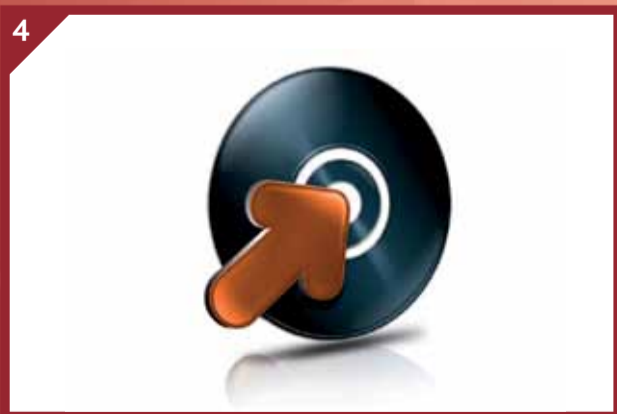
4 Save and backup your notes and diagrams.