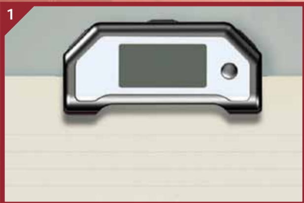
1 Attach the e-pens base unit to normal paper.