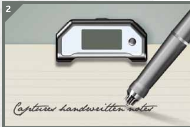
2 Write your notes as normal with the ink filled e-pens digital pen.