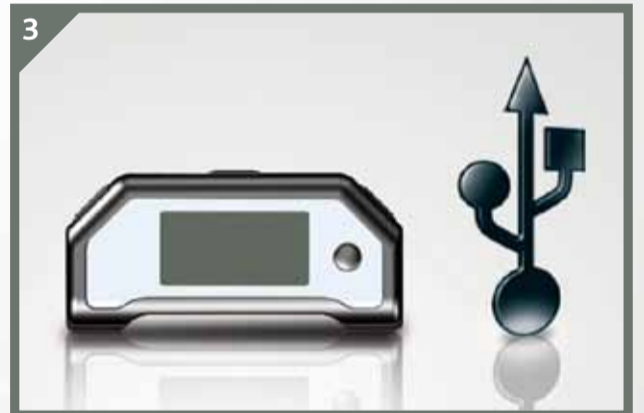
3 Upload your notes via USB to the note manager software.