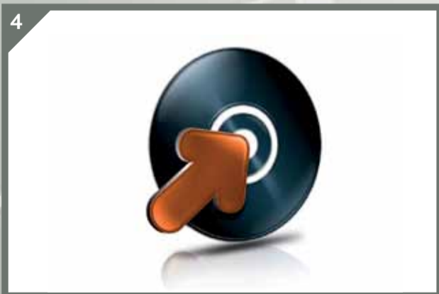
4 Save and backup your notes and diagrams.