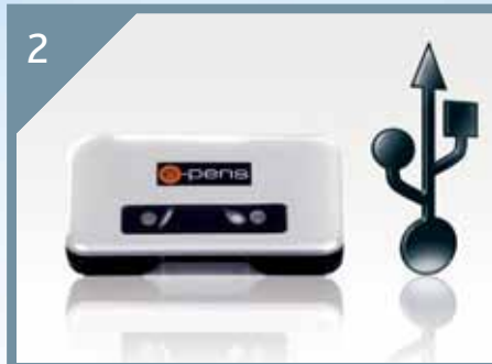
2 Connect the e-pens base unit via USB to your PC.