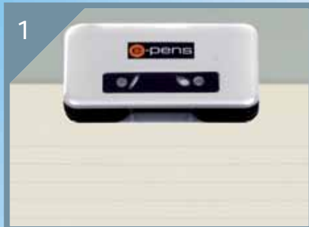
1 Attach the e-pens base unit to normal paper.

Handwritten notes and illustrations captured remotely using an ink filled digital pen!