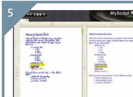
5 Convert your notes to text using the software provided.