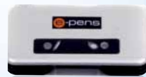
Digital ink pen

Mouse Mode turns the digital pen into a mouse with hovering and 2 button functionality. In Mouse mode you can write directly into Windows Journal, and other Tablet PC applications such as MS OneNote™, MSN Messenger™ and MS Outlook™. Mouse mode speeds up the whole process of capturing notes by switching effortlessly between pen & mouse mode. With MS Vista™ and Windows 7™ there is the extra feature of the 'digital ink handwriting software' feature where you can handwrite directly onto office applications like MS Word® & Windows Journal®. You can also write notes over slides whilst presenting with MS PowerPoint and save or delete them as required.