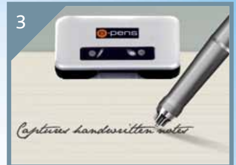
3 Write your notes as normal with the ink filled e-pens digital pen.