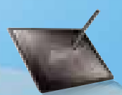
With Vista pen has tablet and mouse functions