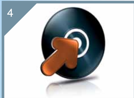
4 Save and backup your notes and diagrams.