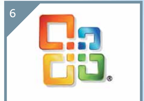
6 Export converted text and diagrams to MS Office and other applications.