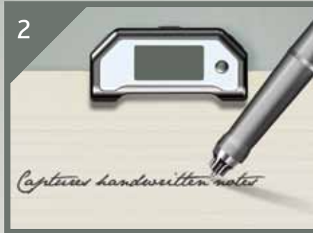
2 Write your notes as normal with the ink filled e-pens digital pen.