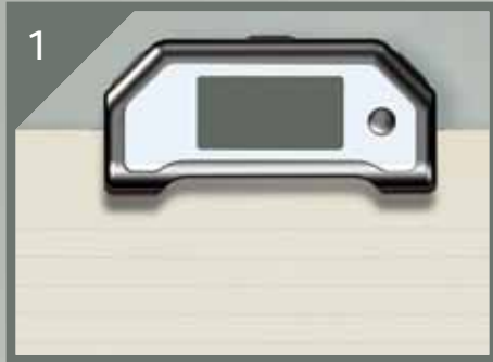
1 Attach the e-pens base unit to normal paper.

Handwritten notes and illustrations captured remotely using an ink filled digital pen!