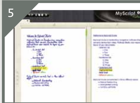
5 Convert your notes to text using the software provided.