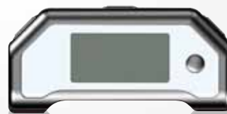
Digital ink pen

Mouse Mode turns the digital pen into a mouse with hovering and 2 button functionality. In Mouse mode you can write directly into Windows Journal, and other Tablet PC applications such as MS OneNote™, MSN Messenger™ and MS Outlook™. Mouse mode speeds up the whole process of capturing notes by switching effortlessly between pen & mouse mode. With MS Vista™ and Windows 7™ there is the extra feature of the 'digital ink handwriting software' feature where you can handwrite directly onto office applications like MS Word® & Windows Journal®. You can also write notes over slides whilst presenting with MS PowerPoint and save or delete them as required.