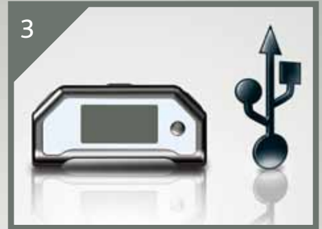
3 Upload your notes via USB to the note manager software.