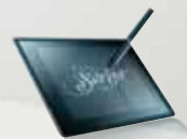
With Vista pen has tablet and mouse functions