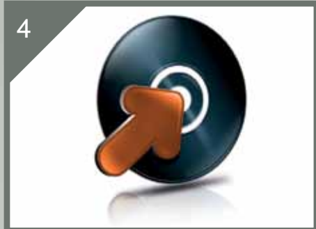
4 Save and backup your notes and diagrams.