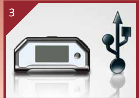
3 Upload your notes via USB to the note manager software.