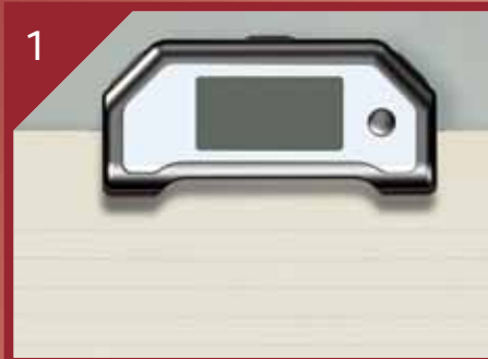
1 Attach the e-pens base unit to normal paper.

Handwritten notes and illustrations captured remotely using an ink filled digital pen!