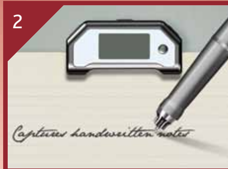
2 Write your notes as normal with the ink filled e-pens digital pen.