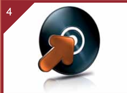
4 Save and backup your notes and diagrams.